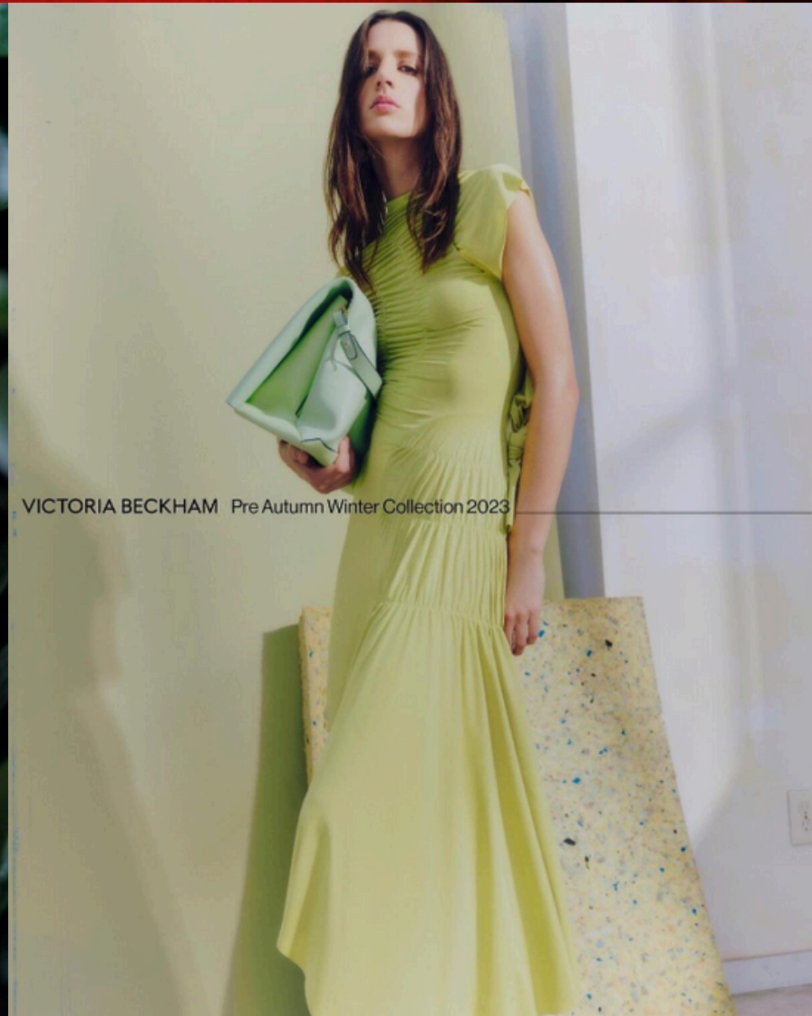
VICTORIA BECKHAM Pre Autumn Winter Collection 2023